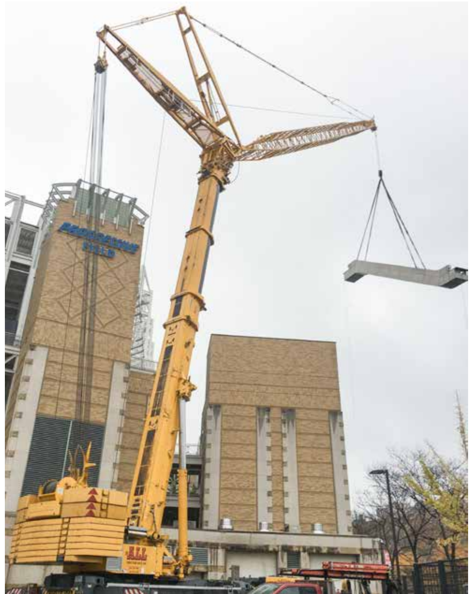
SETTING new escalators at Progressive Field Stadium in Cleveland with a 600 ton crane are operator Jon Knebusch and oiler Erik Rausch, working for ALL Crane.

Perk is working on the East 55th Street road rehabilitation in Cleveland, with Chagrin Valley Paving doing the paving. Perk is also reconstructing a section of Harvard Ave. in Highland Hills and has the Turney Road rehabilitation in Garfield Heights.