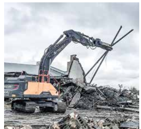
ON THE JOB in Newark, Licking County is Loewendick Demolition.