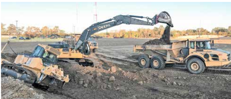
PERFORMING the mass excavation at the Columbus Crew stadium is George J. Igel & Company.