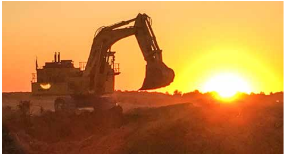
WORKING in Northern Kentucky is Kokosing.

In the city of Dayton, there has been a number of contractors working on various projects. CG Construction & Utilities laid 4,000 feet of 12-inch and 16-inch ductile water main along with 11 fire hydrants. Seven new 4-inch water services have been tapped and service the business in the area. R.B. Jergens performed the hydro excavation on this project to locate existing utilities. On 3rd St. over the Great Miami River, Eagle Bridge is starting a two-year bridge replacement project. In late fall, Eagle Bridge started to build