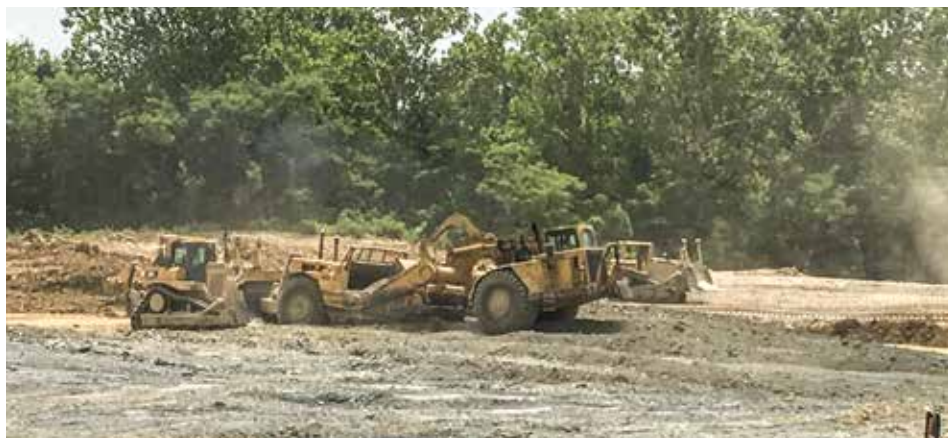
WORKING on new building pad in Northern Kentucky is Coppage Construction.