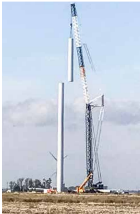
SETTING a tower section on the Timber Road IV Wind Farm in Haviland Village, Paulding County using a Liebherr 1750 is Kiewit Power Constructors.

Rudolph-Libbe is working on the construction of a Pilkington Glass Plant in Troy Township. The owner will construct a 511,000 square foot float glass plant. The plant will make specialty sheet glass for the solar panel manufacturing industry, and its primary customer will be the first solar facility in Perrysburg Township. Only ten miles away, first solar will use the Pilkington Glass to produce its new series six solar panels. The NSG Pilkington plant will produce about 130,000 tons of glass annually. The Pilkington glass plant will keep our members busy well into 2020. Expect to see some work generated from the