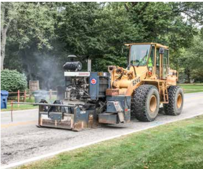
MILLING off the asphalt for a sewer project on Cook Road in Olmsted Falls is Underground Utilities. Tim Lynn is operating the loader.