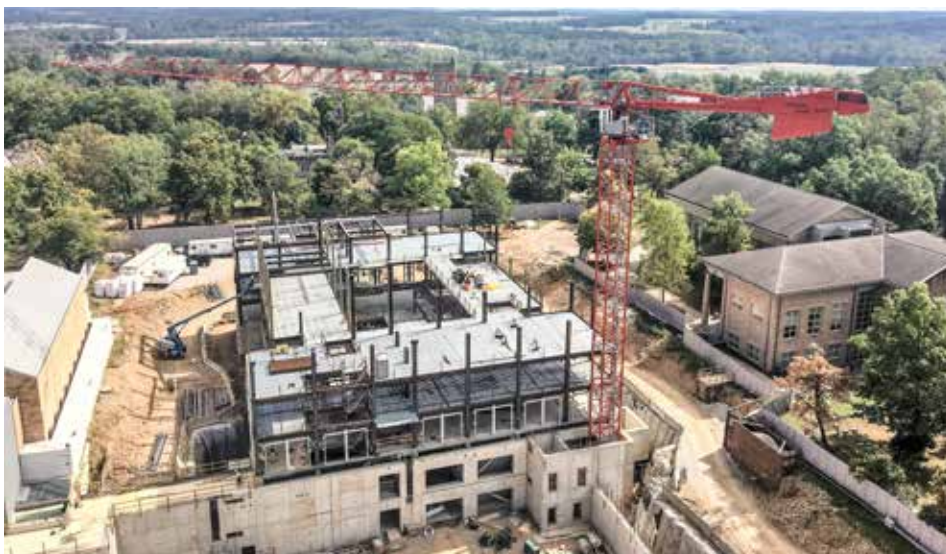
OPERATING a tower crane for ALL Crane in Gambier, Knox County is Wendy Stone.