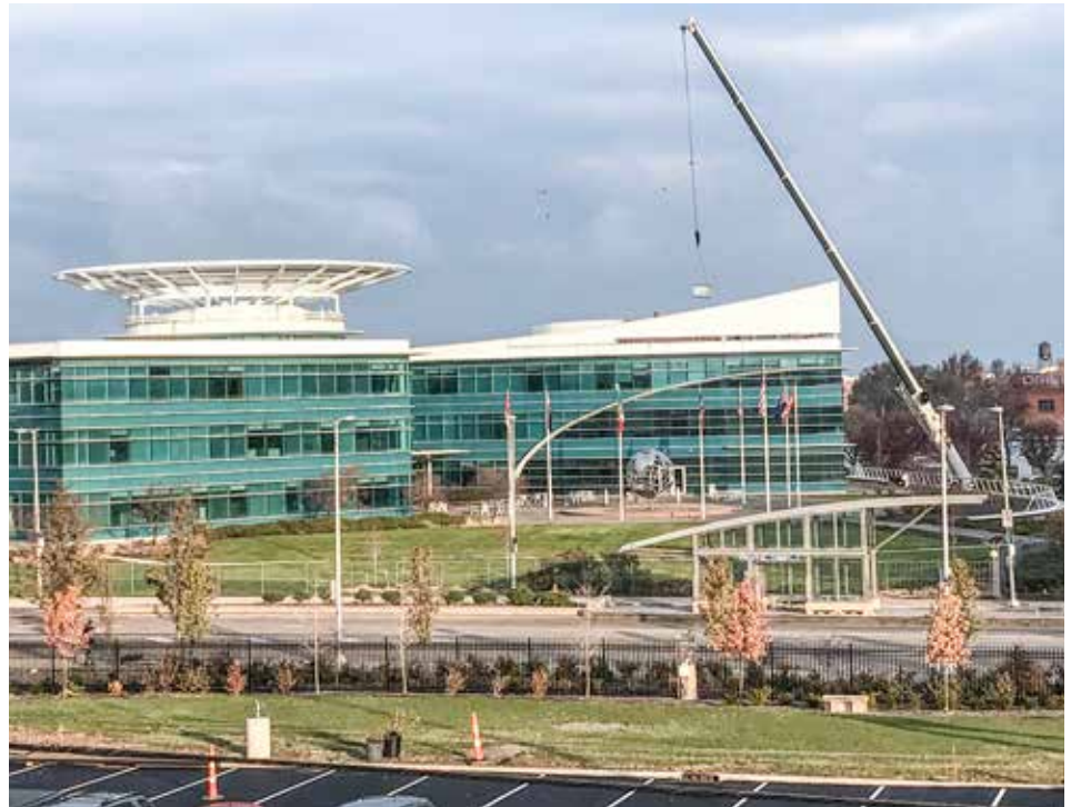
ALL Crane setting panels for Allied Corporation in Cleveland.

In Olmsted Township, Underground Utilities is working on the sanitary sewer project on Cook Rd. Tri-Mor has the concrete road repairs on Tall Oakes Trail. Schirmer Construction is replacing a culvert on Westwood Lane. Chagrin Valley Paving is resurfacing S.R. 252. Marous Brothers is doing the site and