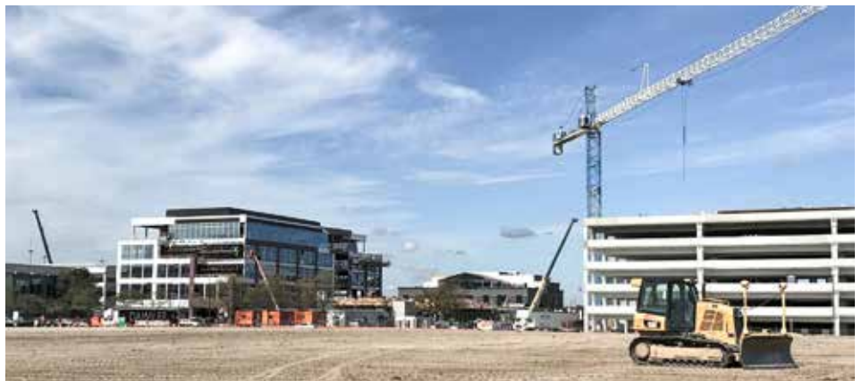
BUSY with Easton Towne Center's expansion project are George J. Igel & Company in the foreground and Wilhelm Construction and ALL Crane of Columbus in the background.