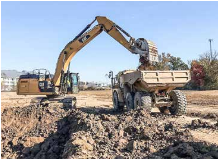
DIGGING a new canal system at Buckeye Lake in Licking County is Miller Brothers.