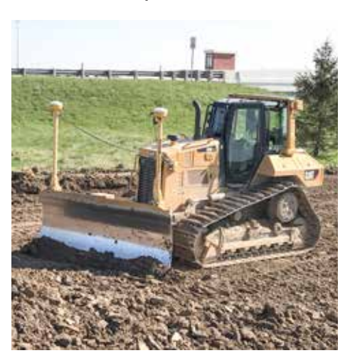
STRIPPING topsoil on the I-75 reconstruction project in Beaverdam for Shelly is Al Perez. additional photos on page 17