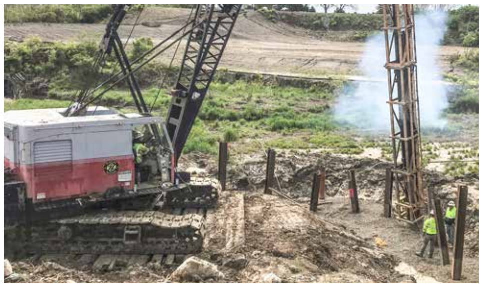
DRIVING piling at Marble Cliff for a pedestrian bridge in Franklin County is Double Z