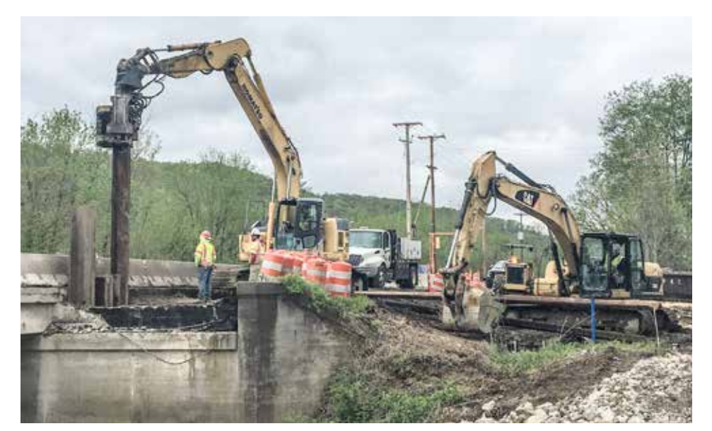
BUSY for Complete General at Otway Village in Scioto County on S.R. 73 are (I-r) Jason Forquer in the excavator placing sheet pilling and Jasper Jenkins running an excavator.