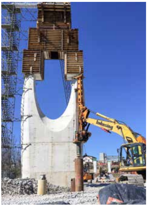
FOUNDATION work on a pedestrian bridge project in Dublin, Franklin County, being done by Kokosing.