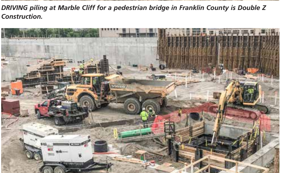
WORKING together at the new Columbus Crew soccer stadium in Franklin County are The George J. Igel & Company and Kokosing Industrial.