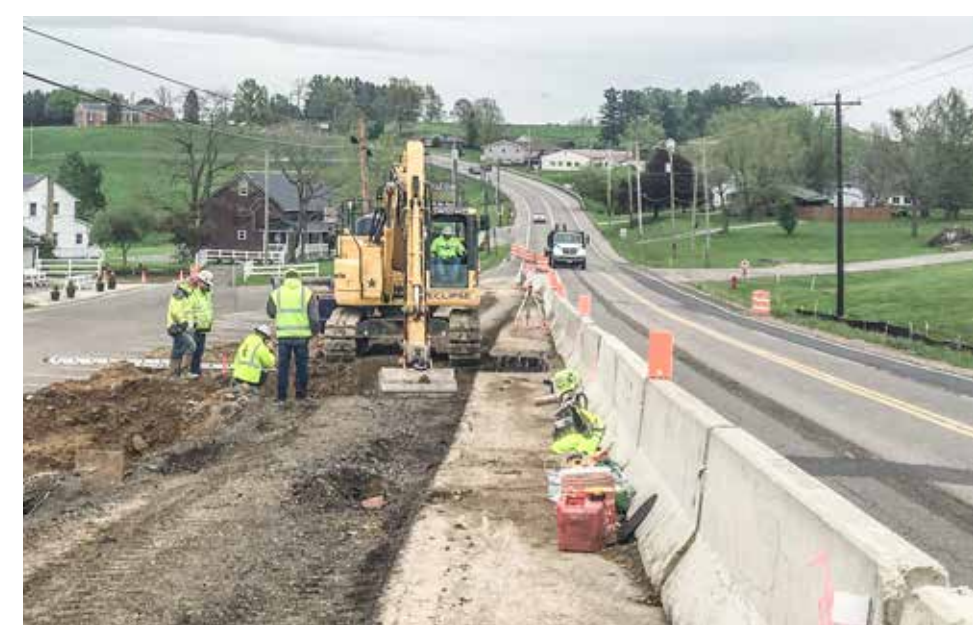
ROAD WIDENING project in Berlin on S.R. 39 being done by Eclipse.

JD & E Contractors & Engineers, Stevens, and McCarls are all working on the new dry fly ash silos in the Cardinal Plant. Shelly & Sands is busy with resurfacing work on S.R. 7 in Stratton. Jet Excavating is working on the S.R. 150 culvert replacement outside of Mingo Junction.