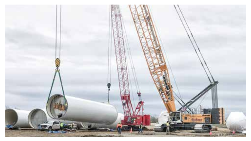
"TRIPPING" the base section on a turbine on the Scioto Ridge Wind Farm in Hardin County is White Construction.