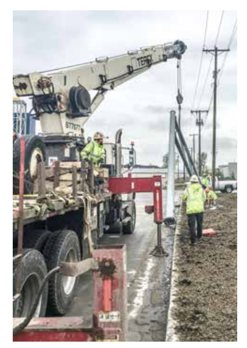
SETTING a sign pole on Mallard Rd. in Toledo for Lake Erie Construction is Tyler Fadenholz.