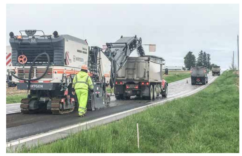
GRINDING on S.R. 3 in Wooster by Kokosing.