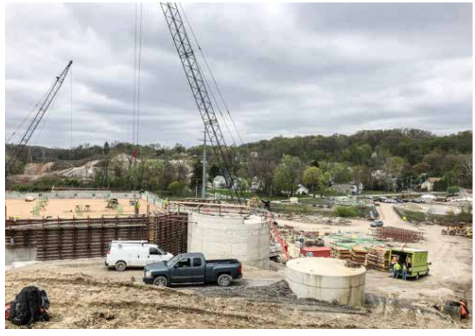
WORKING together on a sewer interceptor in Akron are Kenmore Construction, Kenny/ Obayashi JV and Northstar Contracting.

In Summit County , Shelly & Sands continues ramp and overpass construction, including sewer work and pavement construction at the central interchange project in Akron. R.G. Smith is at the new Leppo Rental building project in Tallmadge grading for parking and landscape areas. Terrace Construction is relocating utilities at the roundabout project on S.R. 615. Northeast Ohio Trenching and Miller Yount Paving have utility and site work at the new Hudson Middle School construction project. H.M. Miller has storm sewer improvements in Akron for the sewer interceptor project. Badger Daylighting is locating broken fiber-optic lines for the City of Stow. Nerone & Sons has mechanical and site work for the Hudson treatment plant.