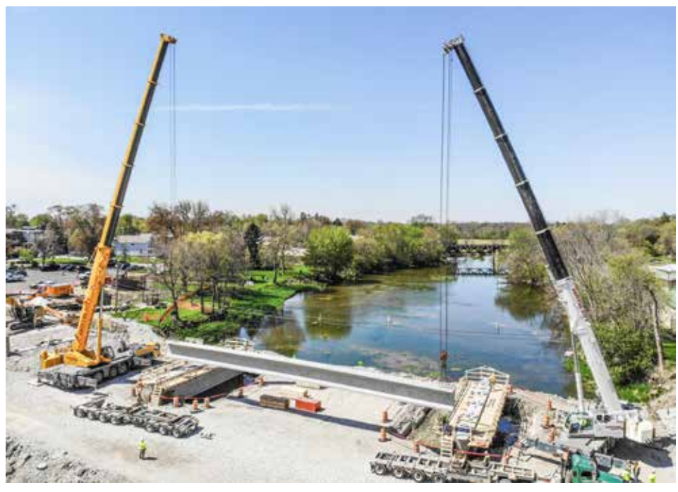
SETTING prestressed concrete bridge beams on Kokosing's S.R. 51 bridge over the Portage River in Elmore is Capital City.