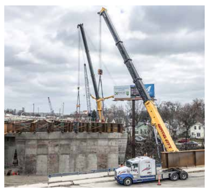
SETTING bridge beams on I-75 in Toledo is Capital City Crane.