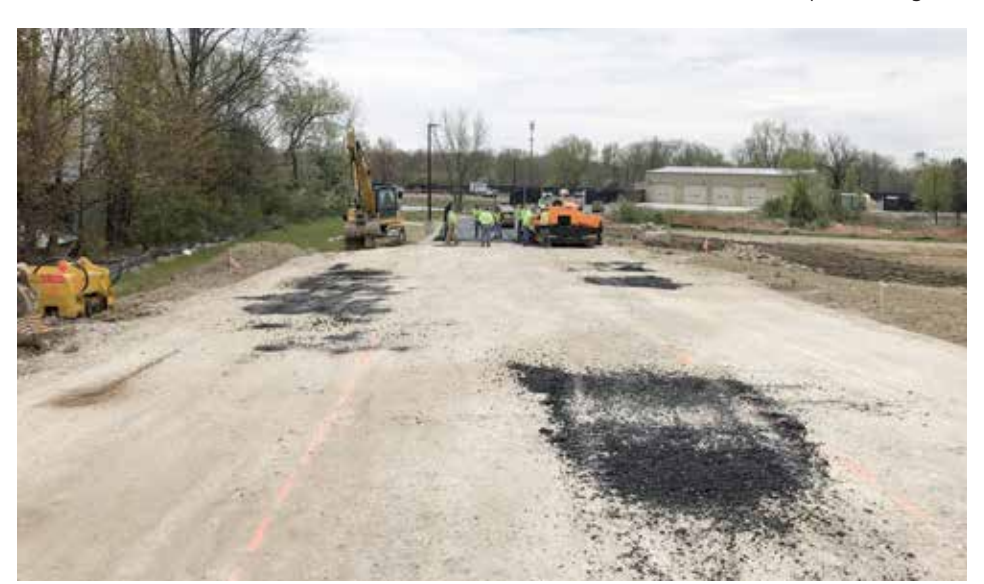
ON THE JOB at the bus garage lot at Revere Local School District is Infinity Paving.

In Monroe County , Kiewit is working two shifts constructing the new Long Ridge Energy Terminal in Hannibal. Kirk Erectors, C&G Erectors, Alliance Constructors, and Reynolds Construction are also on site performing dif-