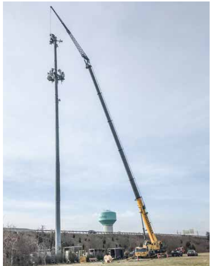
MAINTENANCE on a cell phone tower in Perrysburg performed by Schaedler Enterprises.