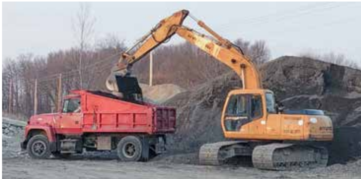
LOADING out topsoil at the New London yard for BCC Ohio is Cody Seasily.