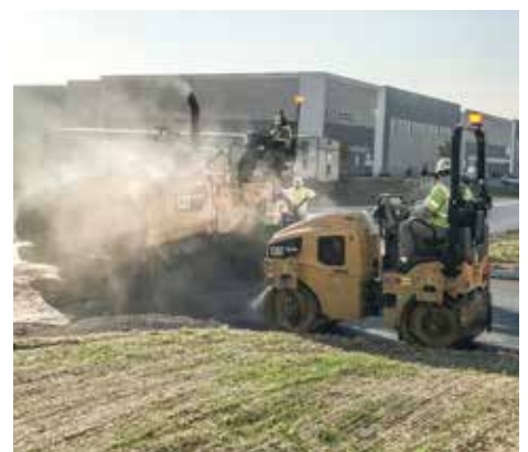
PAVING in Butler County is Spot-On Performance.