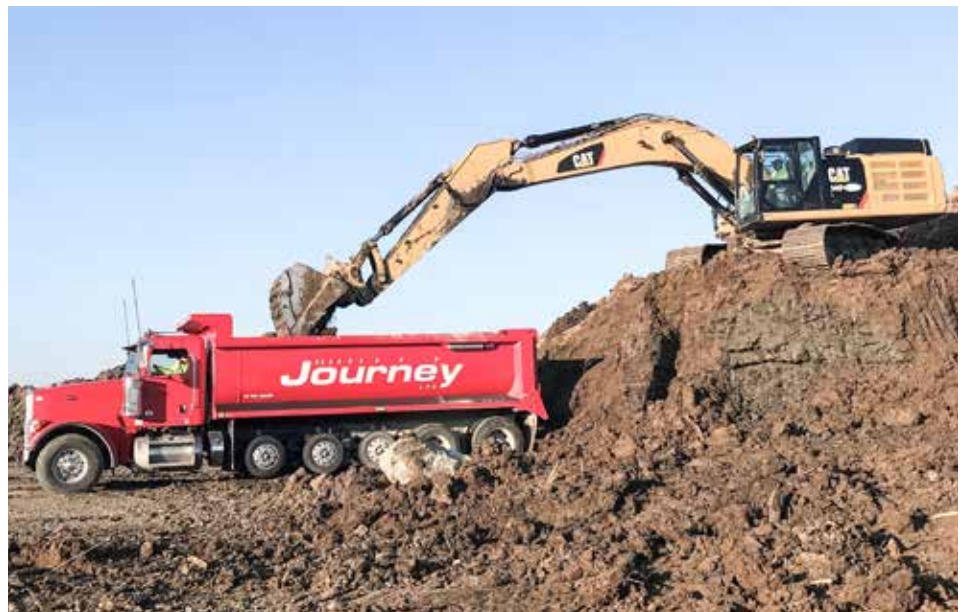
KEEPING busy for Coppage in Liberty Township is Roscoe Hensley III.