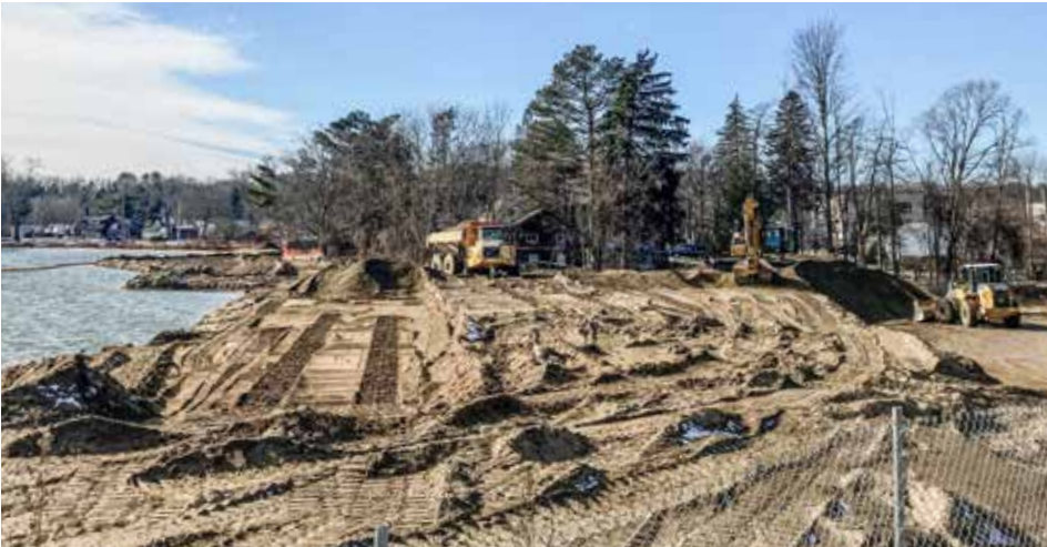
KEEPING busy at the Portage Lakes dam project improvements for the Ohio Department of Natural Resources.