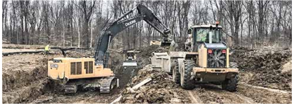
INSTALLING new sanitary sewer in New Albany, Franklin County is Complete General.