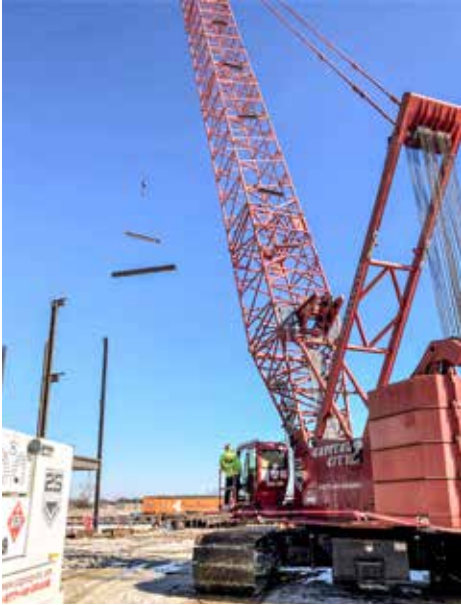
SETTING bridge beams on I-70 in downtown Columbus, Franklin County are Capital City Group and Kokosing Construction.