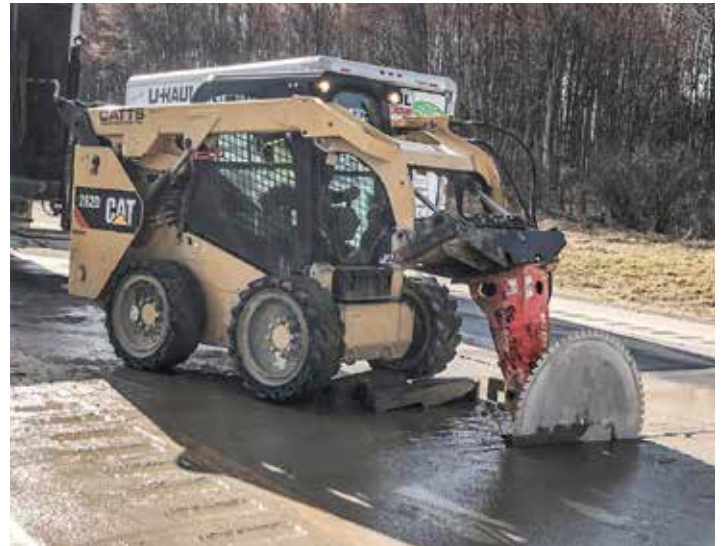
HAMMERING out road joints for repair on S.R. 2 in Amherst for Catts Construction is Ken Nuhfer.

sewer work on Harborview in Cleveland, and the water line on Avalon Drive in Rocky River. Miller Cable is replacing electrical conduit on North Marginal in Cleveland.