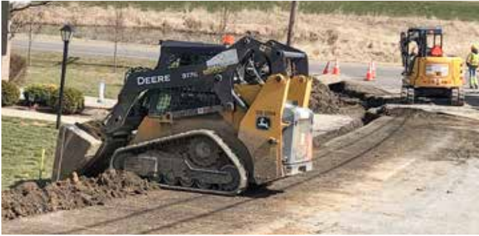
BACKFILLING a gas line on Lorrie Lane in Chippewa Lake for InfraSource is Ryan Kacic.