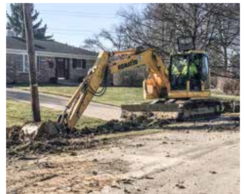
BUSY for Ford Development in West Chester is Sean Fleming.