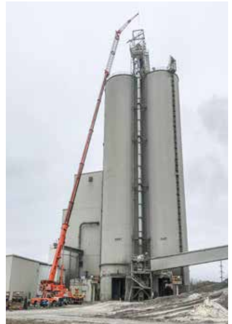
WORKING on silos in Clark County is Piqua Steel Company.