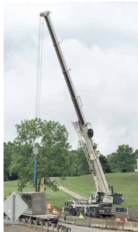
PLACING a box culvert on S.R. 141 for Allard Excavating, Gallia County is Capital City Crane.

Pipeline crews have been scattered throughout Union and Delaware Counties installing new lines for Columbia Gas. Kokosing has the Wyandot County 2021 paving package, keeping up with the demand for asphalt