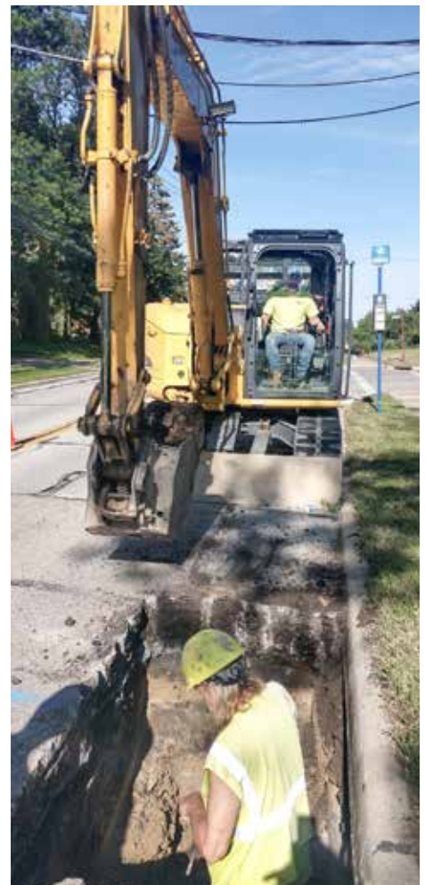
OPERATING an excavator for Monte Construction in Lyndhurst is Dino Montoni. additional photos on page 9