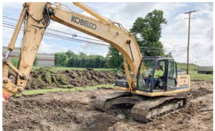
WORKING for Shelly & Sands on I-76 exit ramp construction in Brimfield is operator Greg Shinaberry.