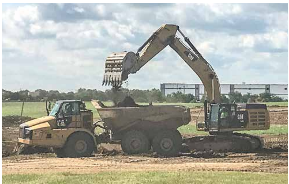
MOVING dirt on a new road project in Pickaway County is Miller Brothers.