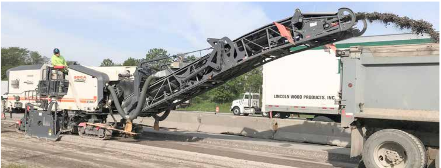
MILLING asphalt for Shelly & Sands on I-71 in Columbus, Franklin County is BOCA.