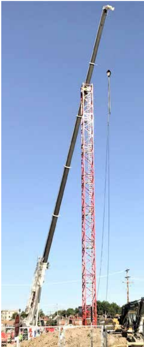
ERECTING a tower crane in East Columbus, Franklin County is ALL Crane.