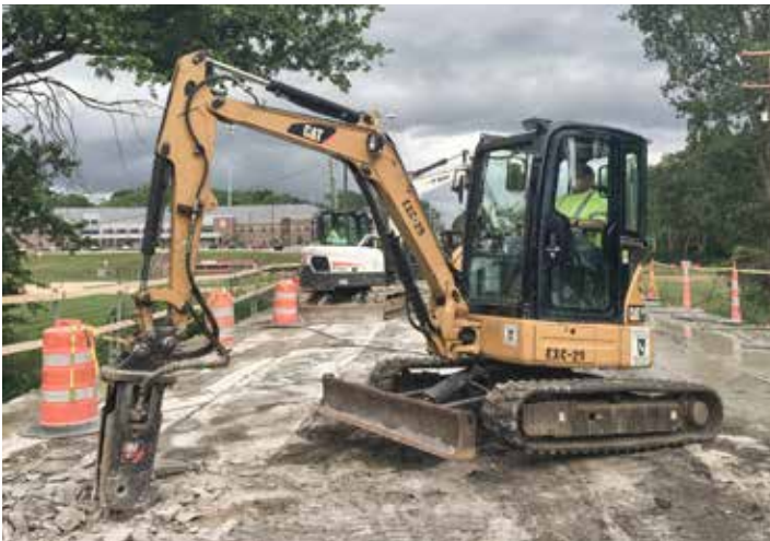
REMOVING the deck on Faircrest Bridge in Canton South is Stanley Miller.