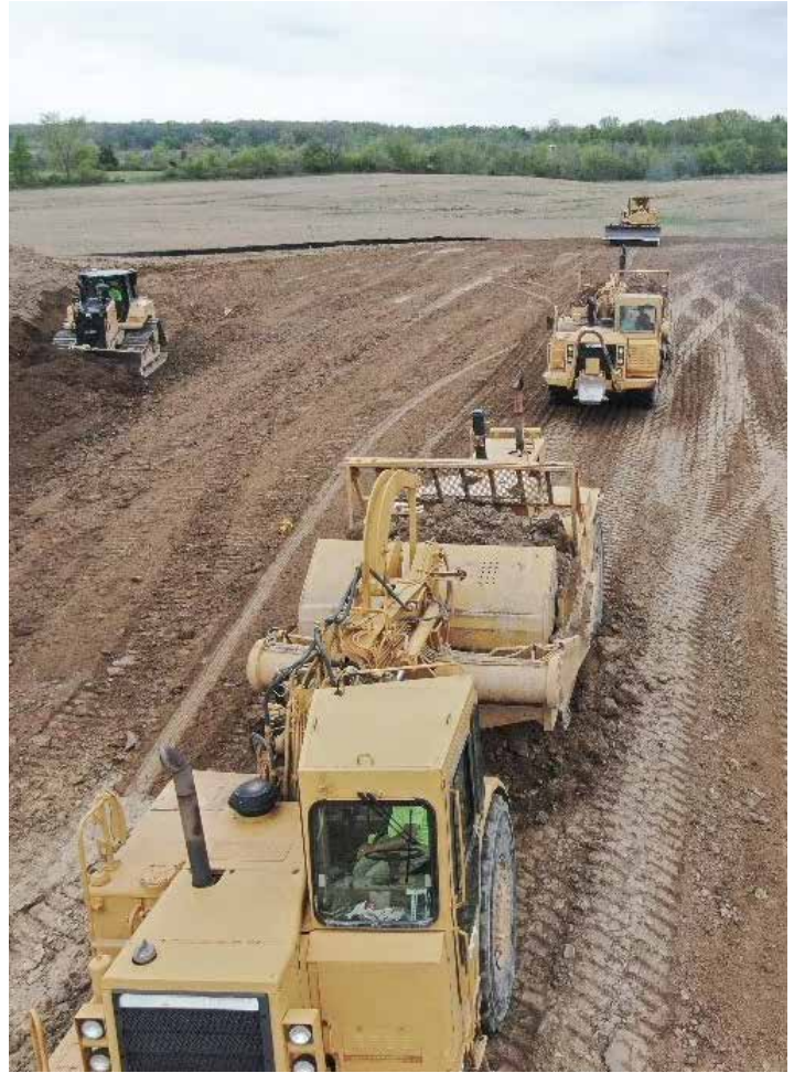
BUILDING lagoons in Kunkle, Ohio is Vernon Nagel.