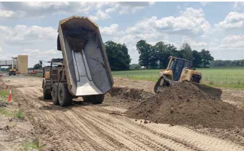
KEEPING busy on the Ohio Turnpike in Swanton is Kokosing.