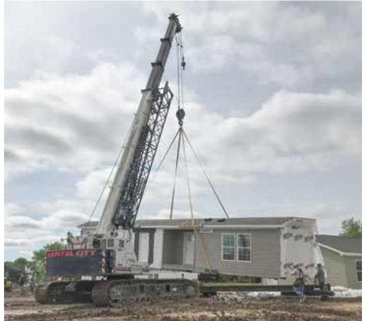
SETTING a modular home for Capital City Crane in Fremont is Jacob Upright.