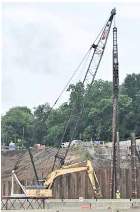
DRIVING piling for bridge replacement in Granville on S.R. 37, Franklin County is Shelly & Sands.