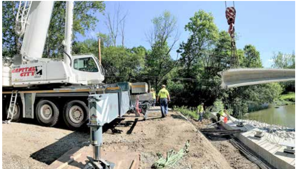
PICKING up 90 ft. long, 96,000 lb. bridge beams in Franklin County is Capital City Group.

Distribution and Maintenance work is keeping RLA Utilities, Miller Pipeline, and Northern Pipeline busy with about 50 crews. Columbia Gas announced it would be nearly doubling its workload, which will increase the