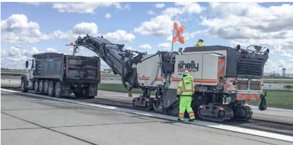
MAKING runway improvements at Cleveland Hopkins Airport is Shelly Company.