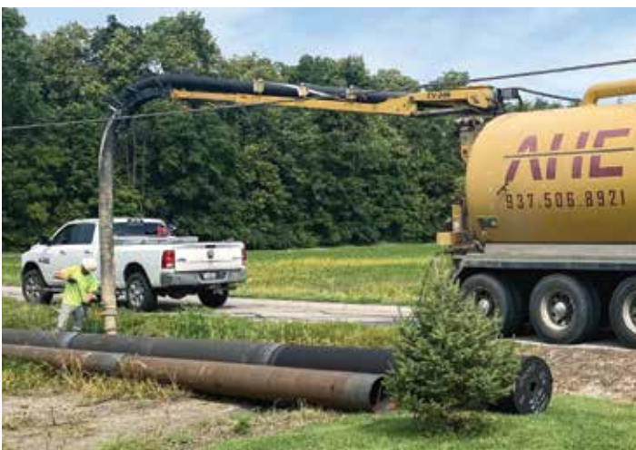
ON THE JOB for Associate Hydro Excavating working in Montgomery County spotting utilities.