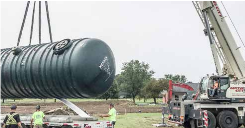
UNLOADING underground storage tanks for a new Turkey Hill Gas Station in Findlay is Capital City Crane.