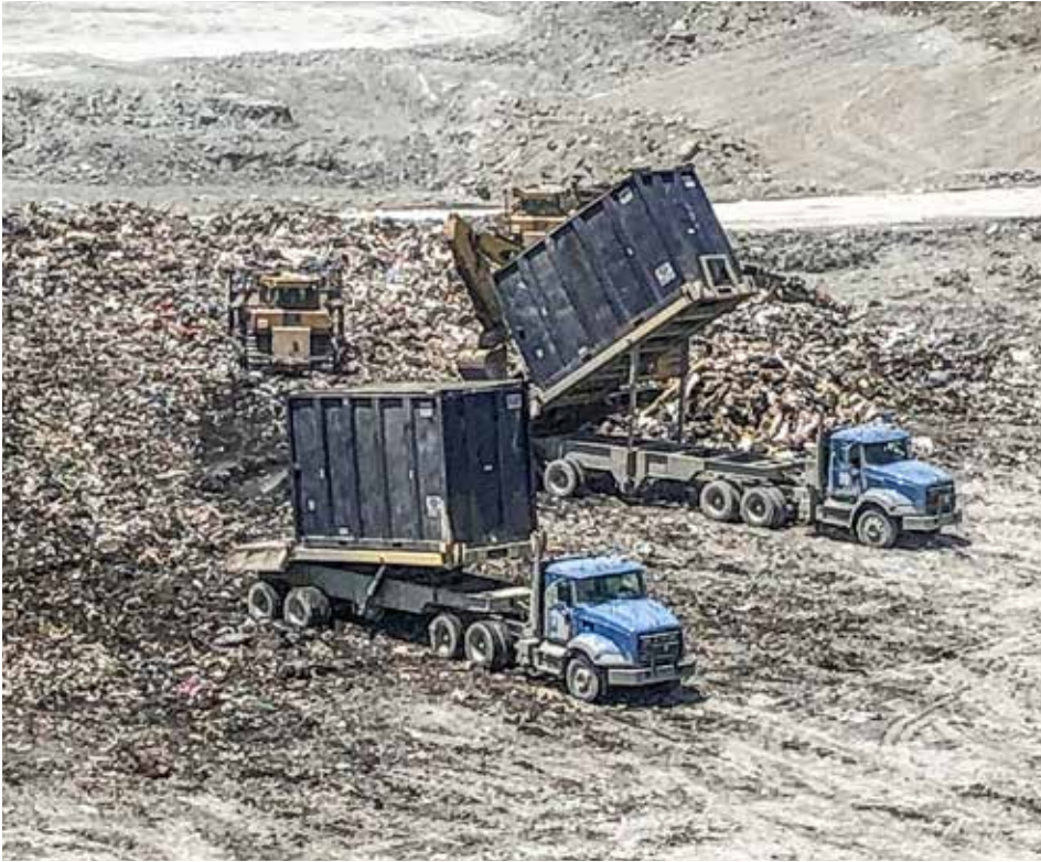
WORKING on The Cell at the Apex Environmental Landfill in Amsterdam, Ohio.

NorthStar is busy with the Minerva City Streets Paving Program. Shelly also has the four-lane resurfacing of U.S. Rt. 30 near Navarre. Beaver Excavating is doing the underground for the new Loves Truckstop on Shuffel Rd. in North Canton. NorthStar has the four-lane resurfacing of U.S. Rt. 62 near Alliance. DRS Enterprises is working on erosion control of the canal in Massillon. Shelly is working on the minor reconstruction of S.R. 241. Kinsey Excavating & Trucking is busy with distribution work for Dominion throughout Canton. Stein, Inc. continues processing scrap and slag at Republic Steel while Edw. C. Levy Co. has several operators doing the same at Timken Steel, both in Canton.