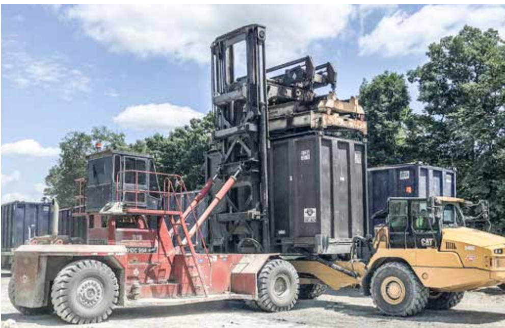
LOADING rail cans onto the trucks that take them to the fill at the Apex Environmental Landfill.