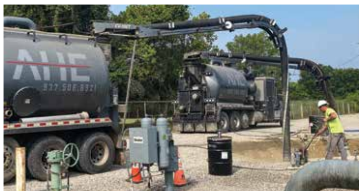
ON THE JOB Associated Hydro Excavating is working at a natural gas station in Montgomery County.