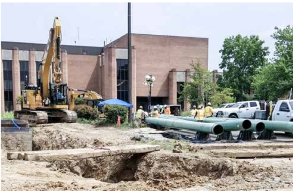
ON THE JOB in Cincinnati is InfraSource.