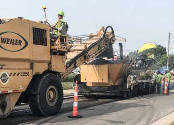
HARD AT WORK are operators for Barrett Paving.