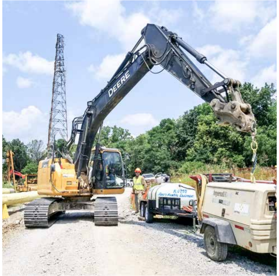
TAKING care of business in Florence Kentucky is InfraSource.

SEDD is working for Contract Rentals in Ashland on 1,090 feet of 16-inch HDD bore. Union Pipeline is working for Dominion on maintenance replacement of 10,720 feet of 8-inch steel pipe in Wayne County near Wooster. Integrity Kokosing Pipeline Services continues to have welders working in Pennsylvania, Indiana, Ohio, and West Virginia.