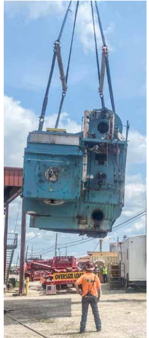
LOADING a 130k oven at The Heinz Company in Fremont is Capital City.