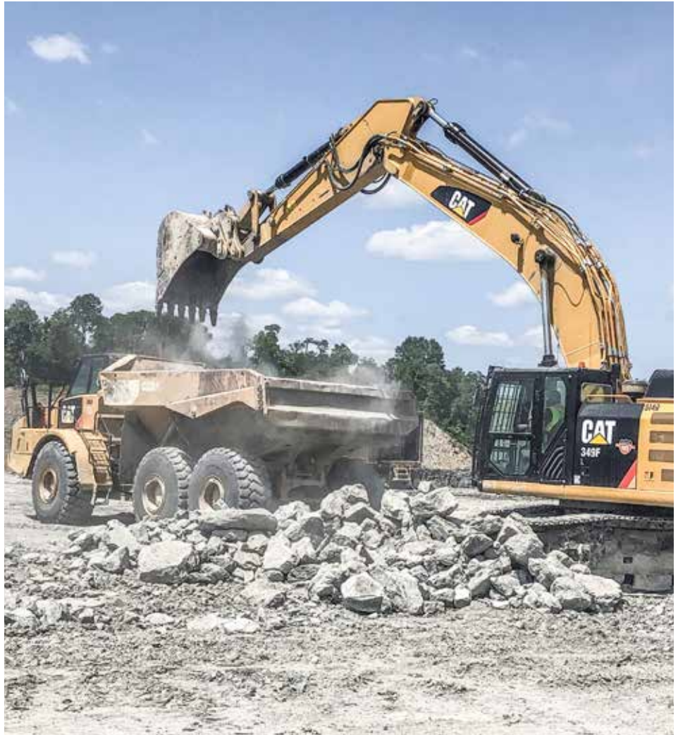
LOADING out rock at the Apex Environmental Landfill.

In Richland County, Shelly & Sands continues the major reconstruction of U.S. Rt. 30 in Mansfield. Kokosing has paving crews busy with the County Resurfacing Program.