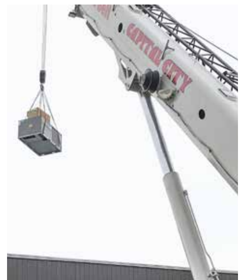
REPLACING air conditioning units in Findlay is Jason Winget in the crane for Capital City Crane.